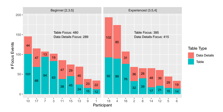
Fig. 6: Number of times participants focus on Table and Data Details views.

3) At-a-glance visualizations help data scientists form instincts: Participants used the Data Details view to get an overall sense of the columns and quickly catch issues. The unique number of elements and 'missingness' insights in the Data Details view helped participants quickly identify and validate issues corresponding to each transformation. P14 used the unique counts for the season column while trying to check how the counts dropped in Task B and was able to spot the missing values in episode ratings that dropped 2 seasons. Participants used the in-line histograms to spot extreme values.